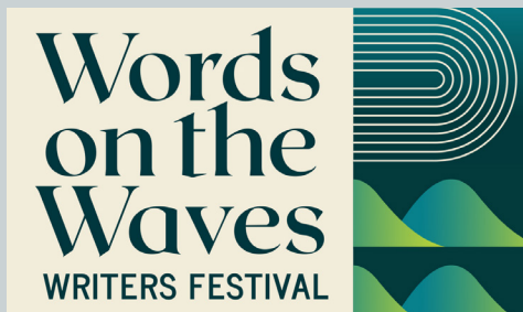
2025 OPENING ADDRESS 28 MAY

A powerful new language that dances the weight of history and the fire of resistance. It holds the warmth of family voices, quiet moments of care, and the heartache of displacement.