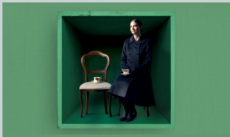
THE QUEEN'S NANNY | ENSEMBLE THEATRE 24 JUN

The first time a Belvoir St Theatre production has come to The Art House. A remarkable, illuminating, shocking, wry and sometimes inspiring piece of theatre, as theatre should be.